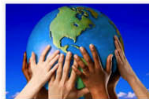
Lorem Ipsum Dolor Sit Amet Consignere Adipsing