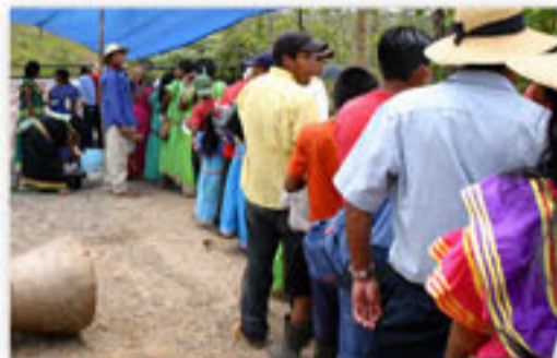
Forest People & Ecosystems