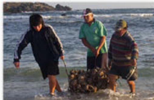
Human Rights & Climate Change