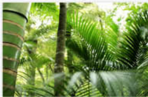
Lorem Ipsum Dolor Sit Amet Consignere Adipsing