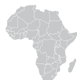
Western and Southern Africa Caribbean